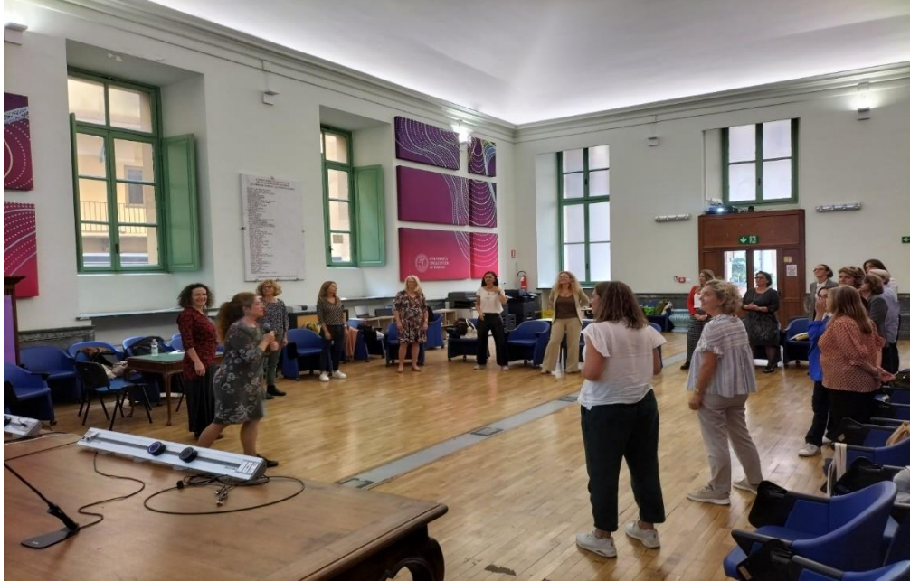
Figure 1: Train the trainers event in Torino

Joint article Mindthegeps/Re-UNITA : https://www.mindthegeps.eu/news/?tarContentId=10335