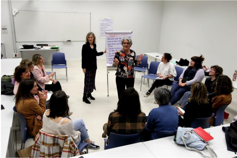
Figure 1. Akademe Programme (University of the Basque Country – ENLIGHT Alliance)